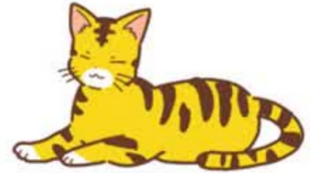
KEEP BAD SECRETS