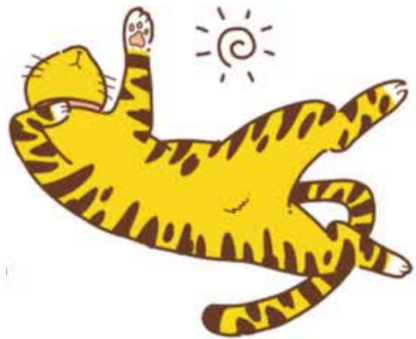
GET STRANGE ILLNESSES