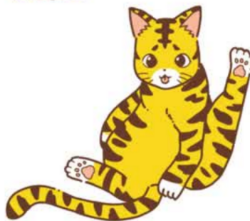
IDENTIFY AS VICTIMS