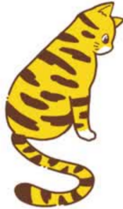
TAKE CARE OF OTHER KITTENS